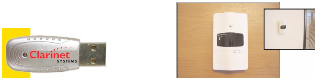
Figure 6: EB5000DT desktop and EB5000WM wall-mount infrared beam