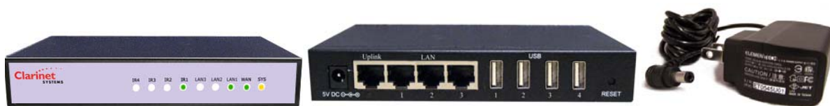
Figure 5: ES5004 component