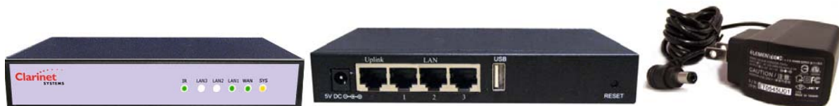
Figure 2: ES5001 component