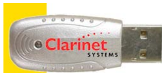
Figure 3: EB5000DT desktop infrared beam